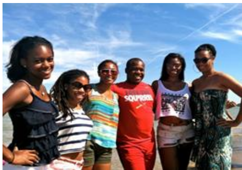
Our wildcats having some fun in the sun!