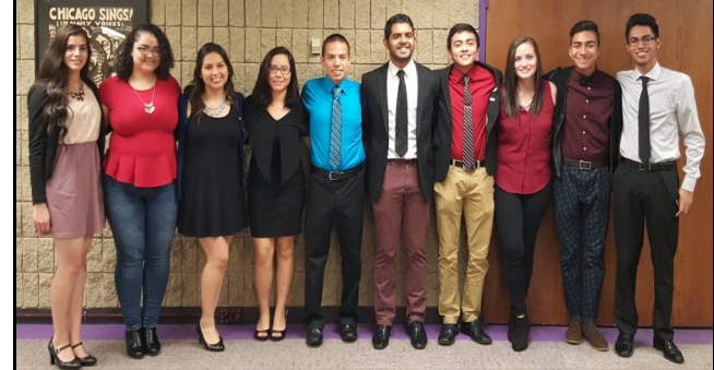
Alianza Executive Board 2015/2016