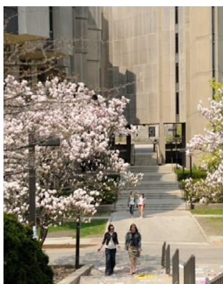
The view from Norris, the hub of student life.

As your juniors plan college trips, they should feel welcome to visit Northwestern. We offer general information sessions and tours Monday through Friday, as well as select Saturdays. We offer sessions specific to our academic programs, too: arts & sciences, engineering, communication, journalism, music, and education & social policy. We also plan to introduce STEM tours in the coming months. Students can browse schedules and register on our website .